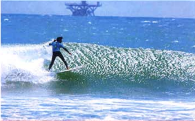
Sponsored Center: WAVES for Development Location: PERU