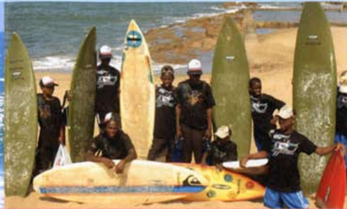
Sponsored Center: Umthambo Surf Club Location: SOUTH AFRICA