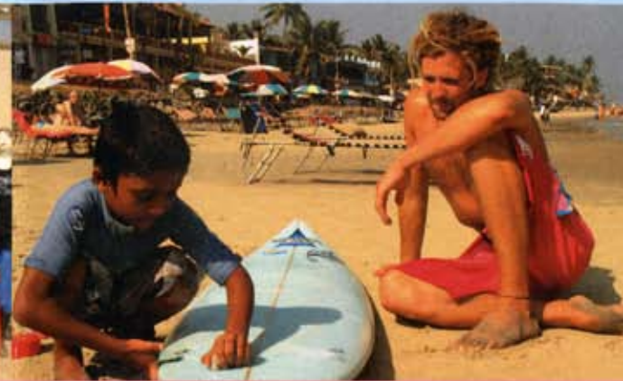
Sponsored Center: Kovalam Surf Club Location: INDIA

WAVES for Development creates life-enriching experiences in coastal communities through Educational Surf programs that develop youth into healthy & empowered adults and Surf Voluntourism programs that engage travelers and transform their world views.